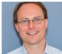
E. Gnan (@SHS)

This course is regularly organized with the support of the Oesterreichische Nationalbank (Austrian Central Bank).