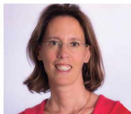
C. Kwapil (© Oesterreichische Nationalbank)