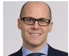
C. Koller (© Paris Zizos)