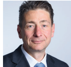
N. Forgó

Requirements: Regular attendance and active participation in class discussions (40%) and an open-book essay exam (60%).